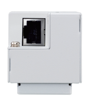
VE1901AUST Top View