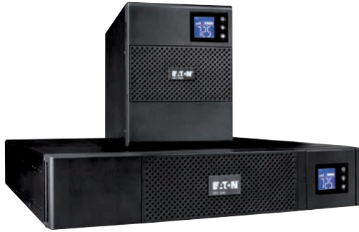
5SC is available in convenient compact form factors