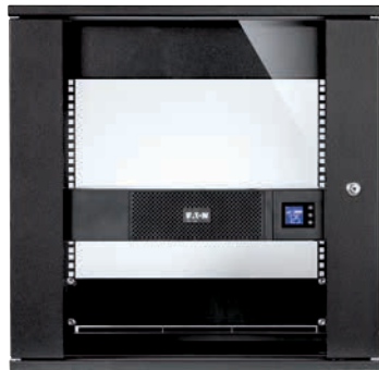
Short depth format for easy integration in small cabinets