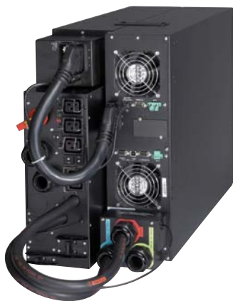
9PX 11kVA with maintenance bypass