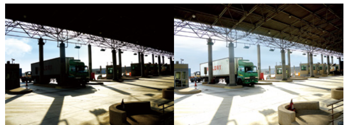
Without WDR Pro