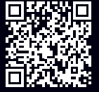
RUT951 360° VIEW

RUT951 took the best features from one of the most popular Teltonika Networks cellular routers - RUT950. This device features dual SIM 4G cellular connectivity combined with Wi-Fi and 4 Ethernet interfaces to meet the needs of the most varied IoT solutions. Automatic WAN failover to an available backup connection ensures network continuity and eliminates downtime. Powered by RutOS that offers customization options for professional use, automation features, and top-level security for your solution. Compatible with the Teltonika Networks Remote Management System (RMS) enables secure remote management to save time and expenses.